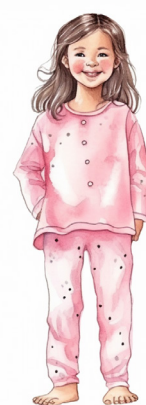
Girl wearing pink pajamas