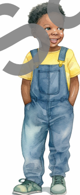
Boy wearing blue overalls, yellow t-shirt and green shoes