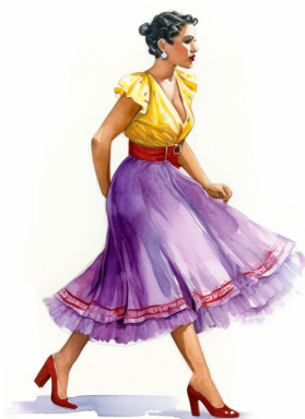
Woman wearing yellow shirt, purple skirt, red belt, red shoes

Using the sign language vocabulary you just learned, describe what each person is wearing.