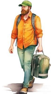
Man with beard wearing long sleeved orange shirt, black backpack, green baseball cap, jeans, brown shoes, holding green luggage